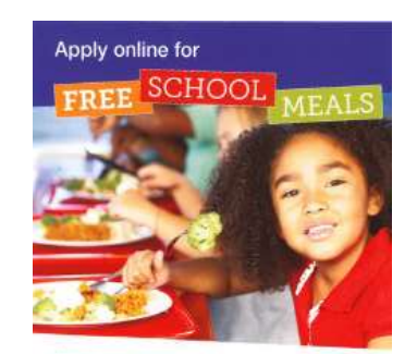
Check to see if your child is eligible using the confidential online portal available on our website www.gloucestershire.gov.wl/freeschoolmeals You can secure a tasty free medifor your child and save yourself up to £437 per year. Plus your child's school receives extra funding for each aligible child registered.

We receive extra funding for each eligible child registered. So even if you don't want your child to have school lunches, you still need to apply to make sure our school receives all the government funding to which is it entitled – helping us provide your child with the best education and support. If you need any help please contact the school office.